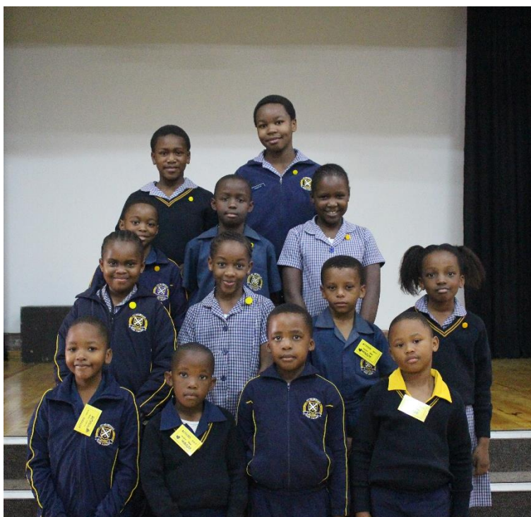
KINDNESS BADGE WINNERS!